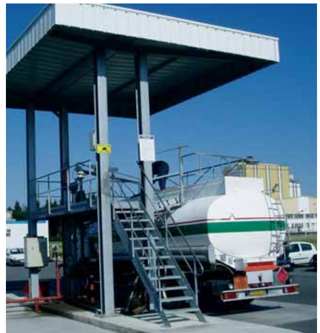
▲ Stationary and mobile applications