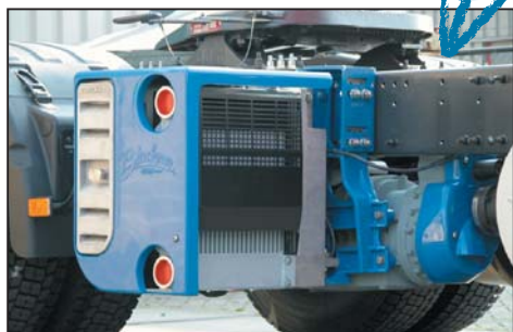
Direct Driven Inter Cooled systems