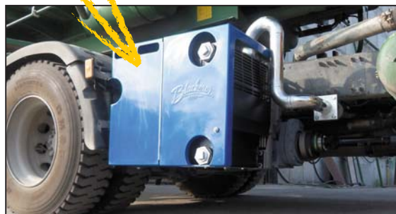
(Suction + Pressure) Direct Driven Inter Cooled systems